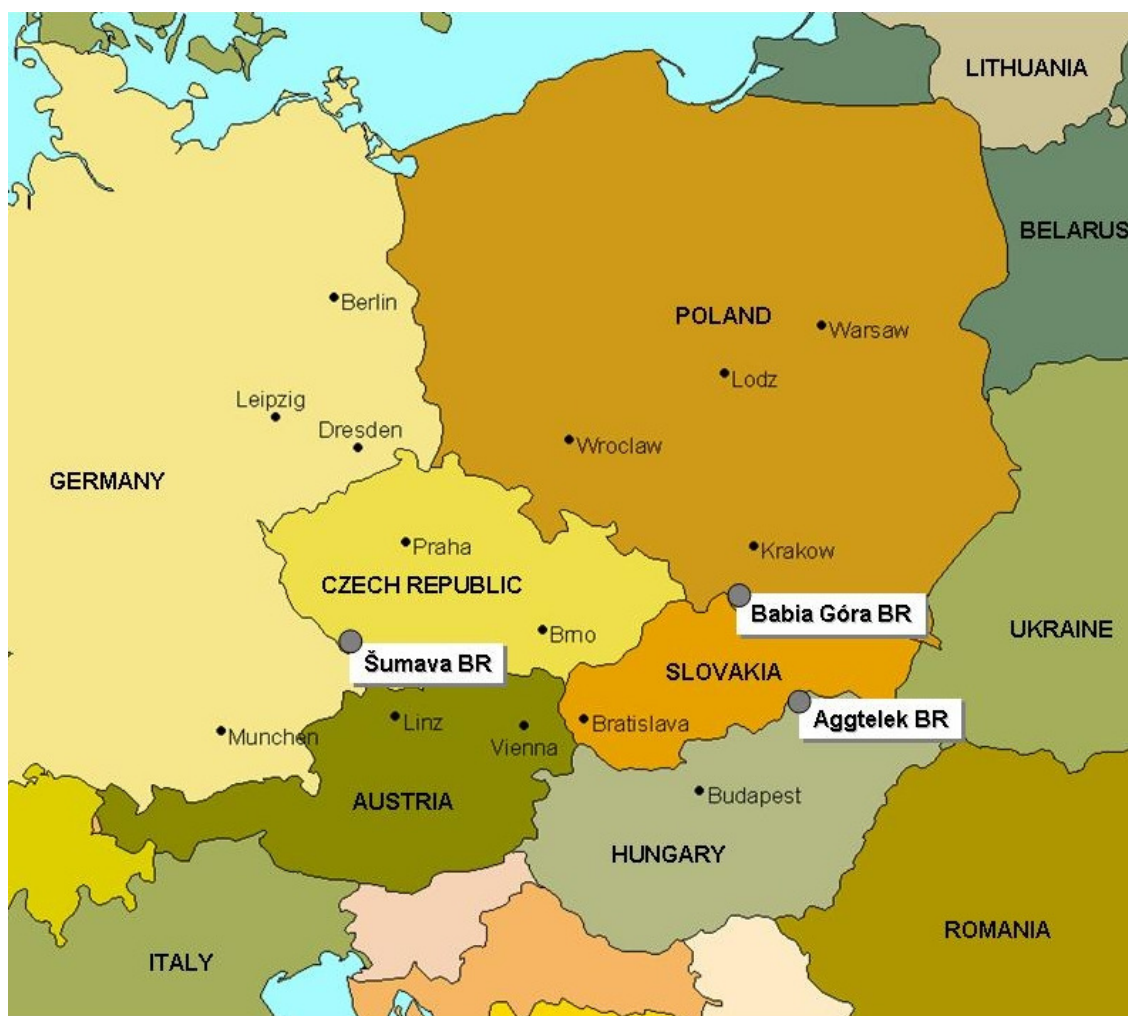
Fig. 2: Location of biosphere reserves involved